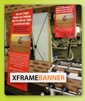
Reinforce your message. Repeat signage in different ways.