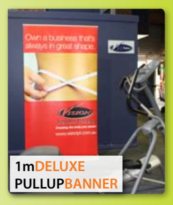
Get Noticed! Display Pull up Banners near where people work out!