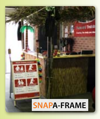
Brand your Reception area. As people walk in draw attention to deals on offer.