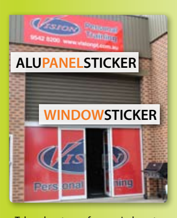
Take advantage of your windows to brand your business.