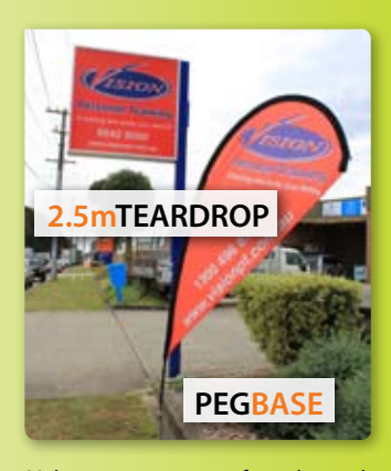
Make sure you are seen from the road. It's vital to have good street presence.