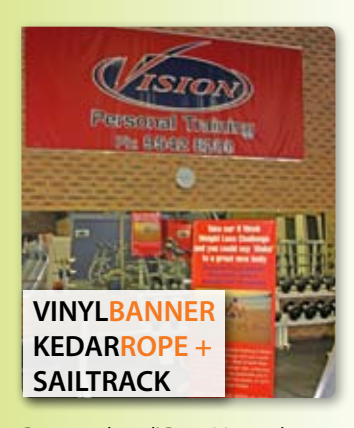
Be remembered! Repetition makes an impact. Position branding in high visability areas e.g. near a clock.